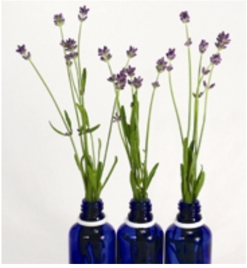
Lavender is loaded with wellness properties.